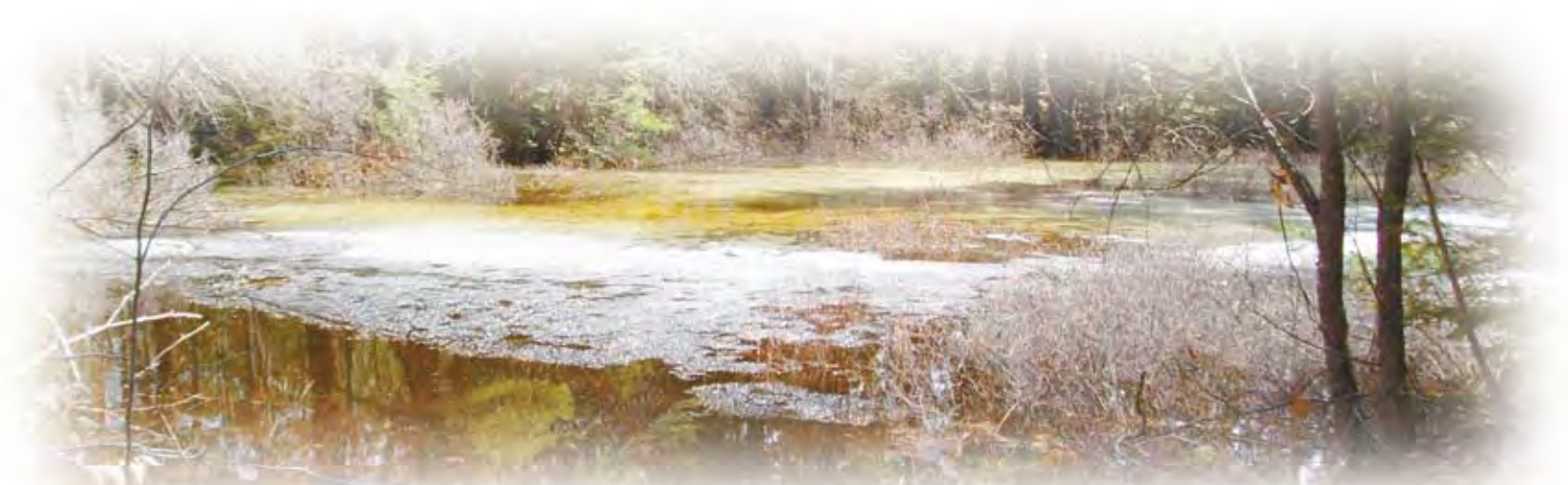
Vernal pool with ice

Significant Wildlife Habitat is an area protected under Maine's Natural Resources Protection Act. The Maine Department of Environmental Protection (DEP) has established criteria to identify significant vernal pools, those with the highest value to wildlife. While forest management is exempt, other development activity within 250 feet of significant vernal pools may require a permit from DEP. The permit review process helps assure that any activities in and around significant vernal pools are done in ways that avoid harm to both wildlife and habitat.