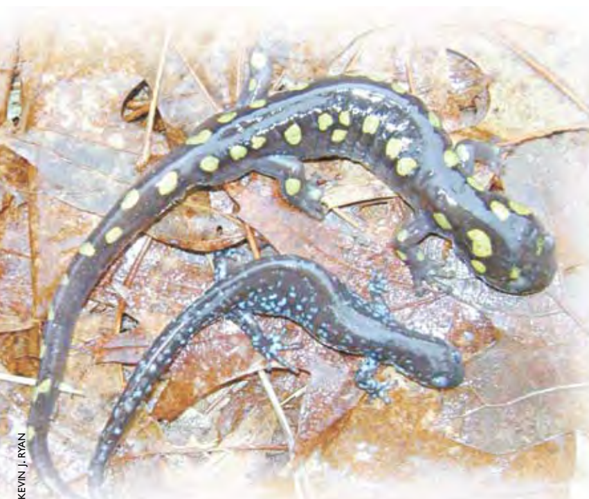
KEVIN J. RYAN

The forested uplands surrounding vernal pools are critically important for the survival of vernal pool amphibians. Pool-breeding species travel from the pools to forested and other wetland habitat where they can find abundant food, safety from predators, and places to hibernate. A vernal pool in isolation from these other important habitats will not sustain its amphibian population. To maintain healthy populations of vernal pool wildlife, it is important to maintain relatively undisturbed forest adjacent to pools. It is also important to maintain corridors of habitat among clusters of vernal pools, since amphibians and turtles may use multiple pools as stepping stones on their way to and from other habitats.